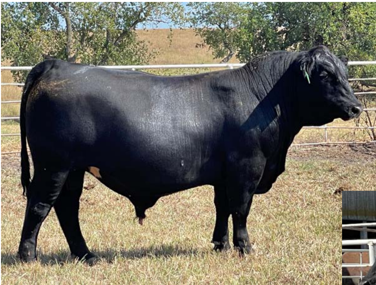
Lot 1 • SimAngus

Saturday, November 11, 2023 AT THE RANCH, WHEATON, KS