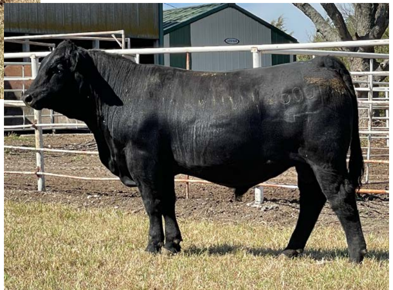
Lot 11 • SimAngus